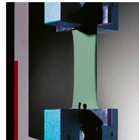
TENSILE STRENGTH TESTING