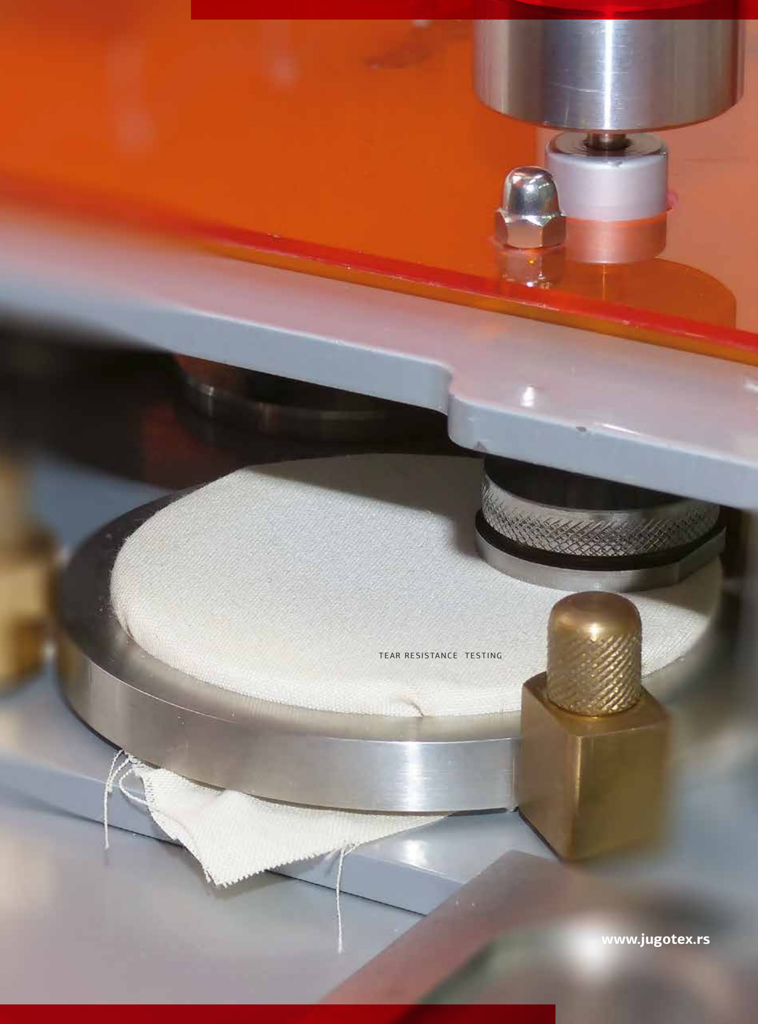
TEAR RESISTANCE TESTING